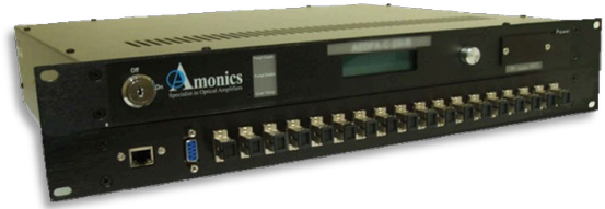
2U Rackmount Casing