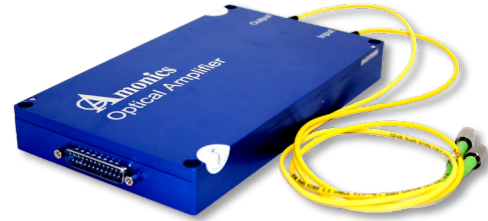
AEDFA-PM-UL- NS-200-20-33-M Casing