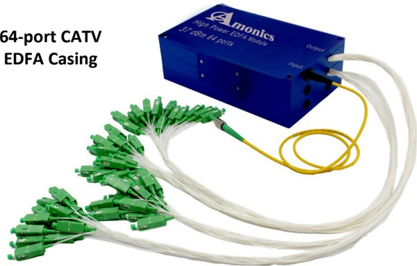
64-port CATV EDFA Casing